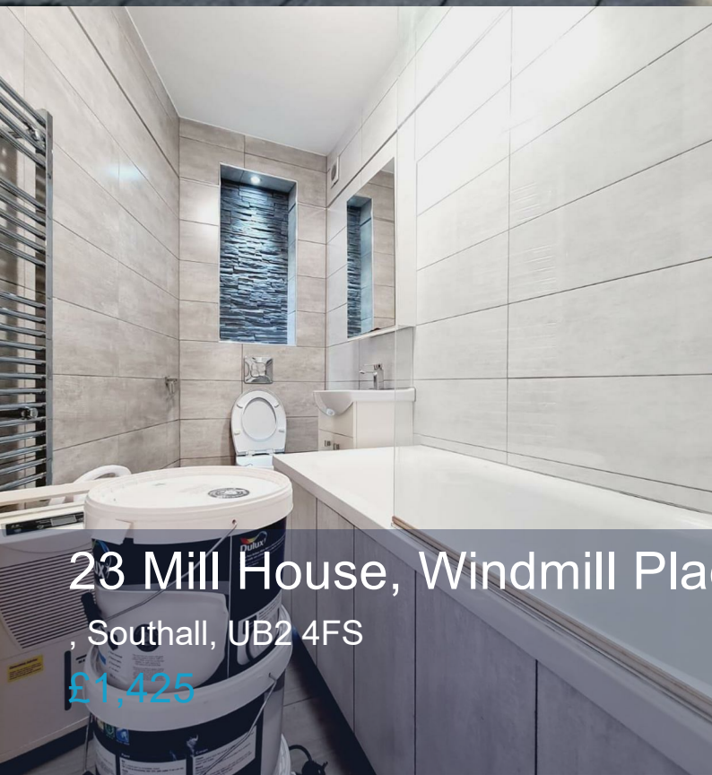
23 Mill House, Windmill Place , Southall, UB2 4FS £1,425